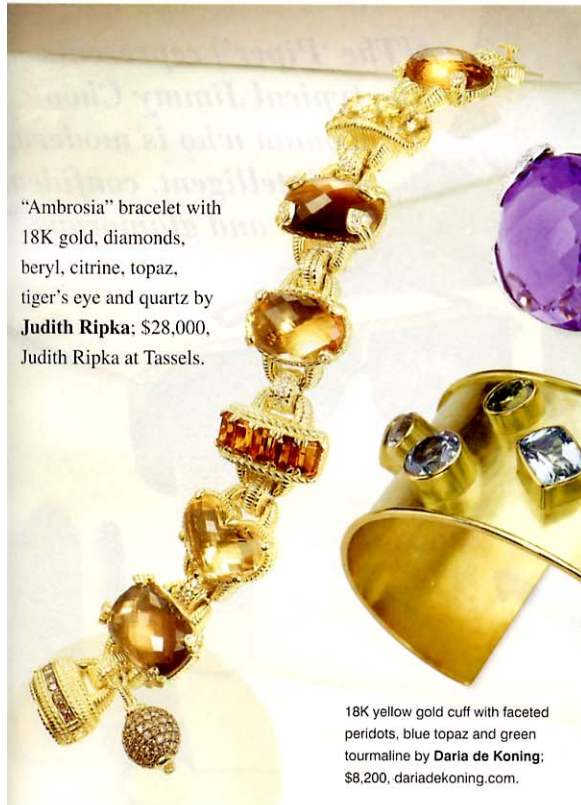
"Ambrosia" bracelet with 18K gold, diamonds, beryl, citrine, topaz, tiger's eye and quartz by Judith Ripka : $28,000, Judith Ripka at Tassels.