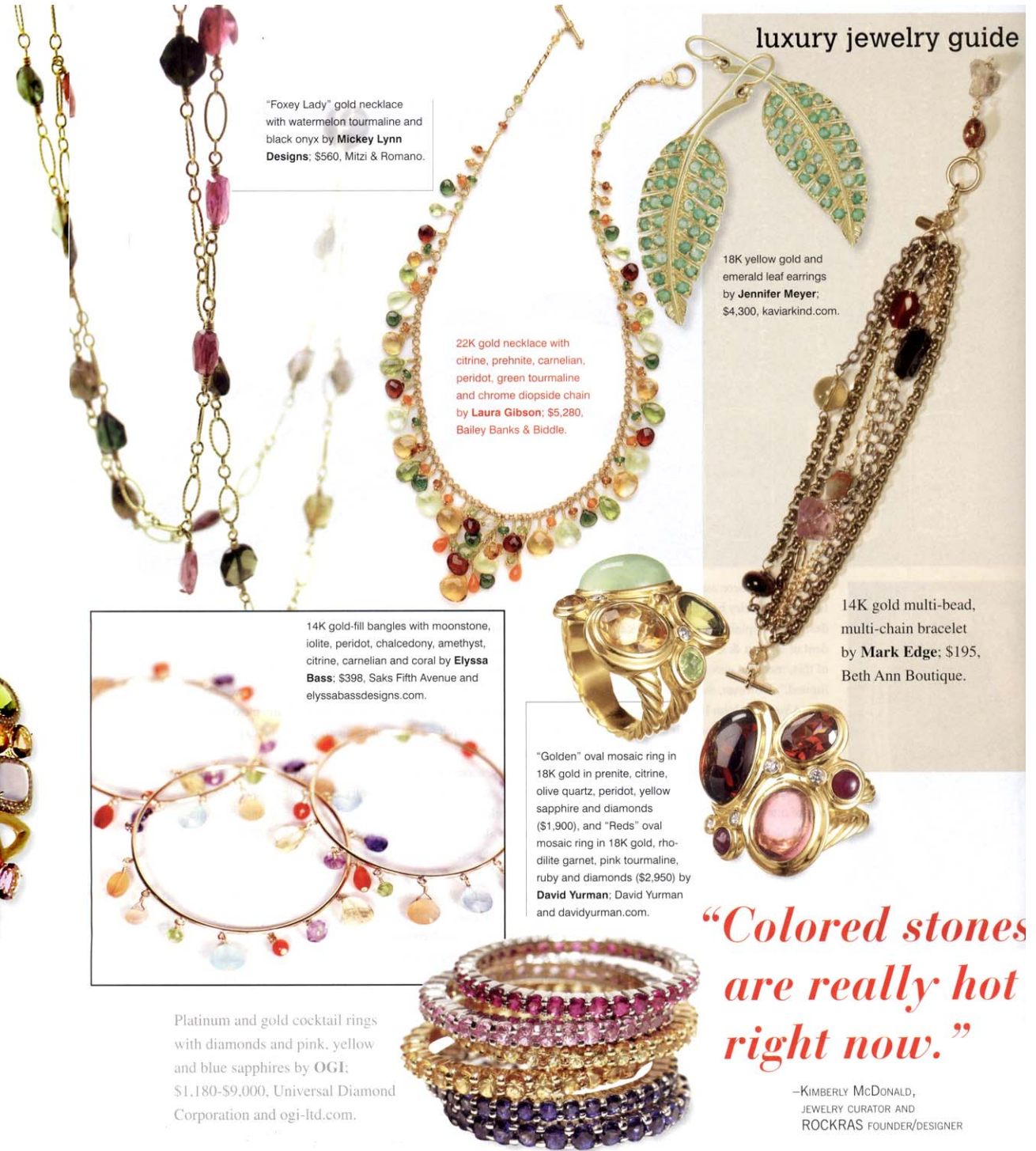
"Foxy Lady" gold necklace with watermelon tourmaline and black onyx by Mickey Lynn Designs: $560, Mitzi & Romano .