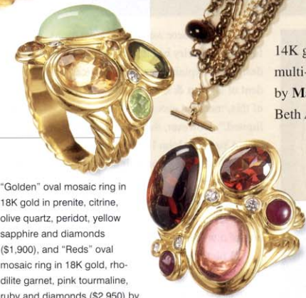
"Golden" oval mosaic ring in 18K gold in prenite, citrine, olive quartz, peridot, yellow sapphire and diamonds ($1,900), and "Reds" oval mosaic ring in 18K gold, rhodilite garnet, pink tourmaline, ruby and diamonds ($2,950) by David Yurman : David Yurman and davidyurman.com .