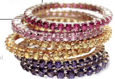
Platinum and gold cocktail rings with diamonds and pink, yellow and blue sapphires by OGI : $1,180-$9,000, Universal Diamond Corporation and ogi-ltd.com .

"Colored stones are really hot right now."