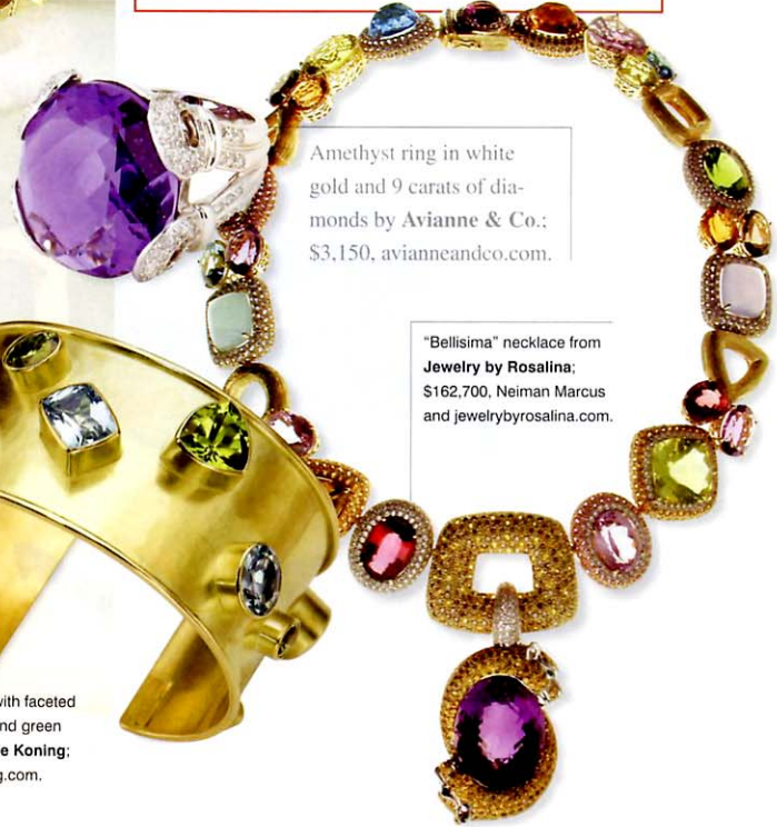
Amethyst ring in white gold and 9 carats of diamonds by Avianne & Co. : $3,150, avianneandco.com .